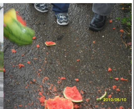
This is what happens when melons without helmets hit the ground!